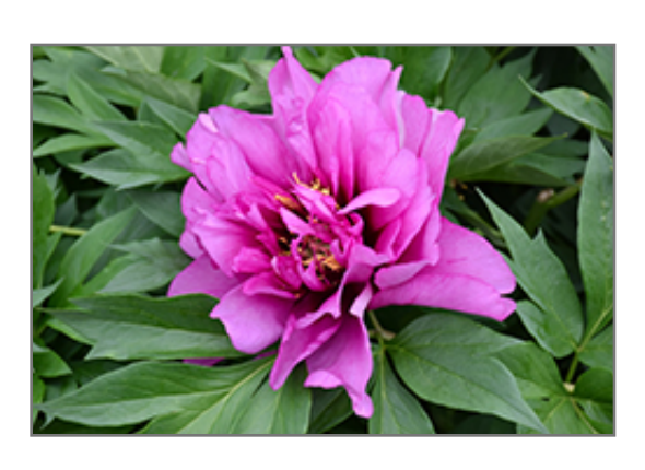
Morning Lilac Peony flowers

Amazing semi-double flowers are lilac colored with a dark purple center flare around the golden stamens; the petals are streaked with white and dark purple to further add to their beauty