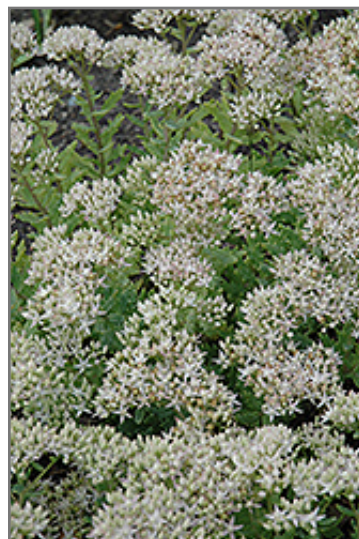
Thundercloud Stonecrop flowers

This is a relatively low maintenance plant, and is best cleaned up in early spring before it resumes active growth for the season. It is a good choice for attracting bees and butterflies to your yard, but is not particularly attractive to deer who tend to leave it alone in favor of tastier treats. It has no significant negative characteristics.