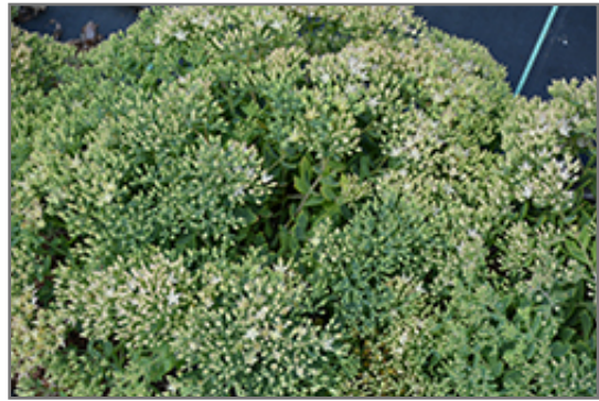
Thundercloud Stonecrop flower buds

Thundercloud Stonecrop is a fine choice for the garden, but it is also a good selection for planting in outdoor pots and containers. It is often used as a 'filler' in the 'spiller-thriller-filler' container combination, providing a mass of flowers and foliage against which the thriller plants stand out. Note that when growing plants in outdoor containers and baskets, they may require more frequent waterings than they would in the yard or garden.