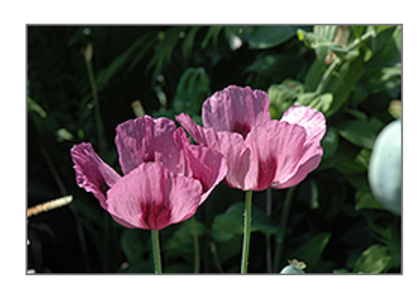
Patty's Plum Poppy flowers

This exquisite selection is sought after for good reason; the numerous six inch wide ruffled plum purple to lavender flowers display contrasting blotches and deep purple centers; stunning when massed in mid-border plantings