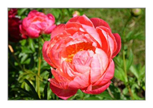
Coral Charm Peony flowers

Coral Charm Peony is recommended for the following landscape applications;