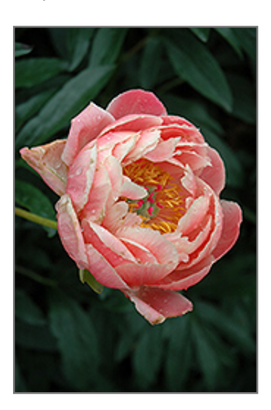
Coral Charm Peony flowers