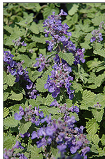
Little Titch Catmint flowers