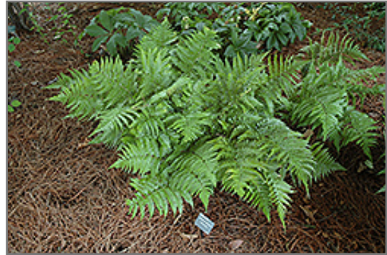
Autumn Fern

Autumn Fern will grow to be about 18 inches tall at maturity, with a spread of 18 inches. Its foliage tends to remain dense right to the ground, not requiring facer plants in front. It grows at a medium rate, and under ideal conditions can be expected to live for approximately 15 years. As an evergreen perennial, this plant will typically keep its form and foliage year-round.