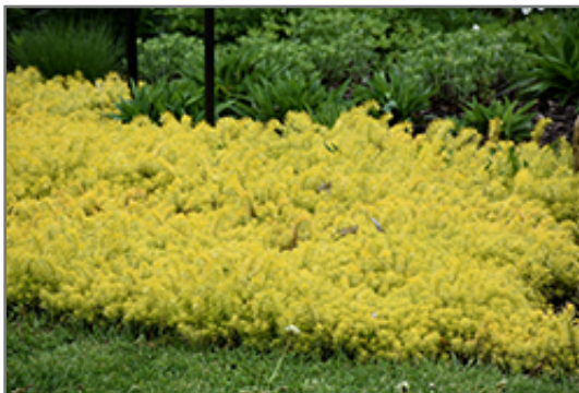
Angelina Stonecrop

This plant does best in full sun to partial shade. It prefers dry to average moisture levels with very well-drained soil, and will often die in standing water. It is considered to be drought-tolerant, and thus makes an ideal choice for a low-water garden or xeriscape application. It is not particular as to soil pH, but grows best in poor soils, and is able to handle environmental salt. It is highly tolerant of urban pollution and will even thrive in inner city environments. This is a selected variety of a species not originally from North America. It can be propagated by division; however, as a cultivated variety, be aware that it may be subject to certain restrictions or prohibitions on propagation.