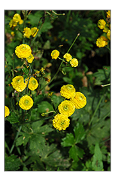
Yellow Bachelor's Button flowers

Yellow Bachelor's Button has masses of beautiful double yellow round flowers at the ends of the stems from early summer to late fall, which are most effective when planted in groupings. The flowers are excellent for cutting. Its serrated lobed leaves remain green in color throughout the season.