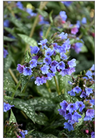
Trevi Fountain Lungwort flowers