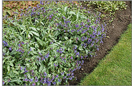
Trevi Fountain Lungwort in bloom

Trevi Fountain Lungwort will grow to be about 12 inches tall at maturity, with a spread of 18 inches. When grown in masses or used as a bedding plant, individual plants should be spaced approximately 15 inches apart. Its foliage tends to remain dense right to the ground, not requiring facer plants in front. It grows at a medium rate, and under ideal conditions can be expected to live for approximately 10 years. As an herbaceous perennial, this plant will usually die back to the crown each winter, and will regrow from the base each spring. Be careful not to disturb the crown in late winter when it may not be readily seen!