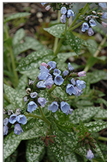
Roy Davidson Lungwort flowers