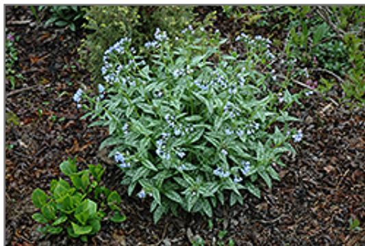
Roy Davidson Lungwort in bloom