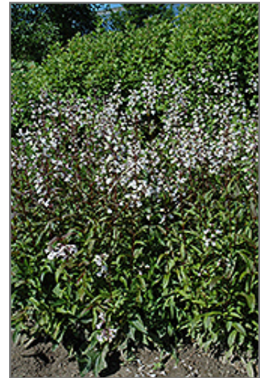
Husker Red Beard Tongue in bloom

Husker Red Beard Tongue is a fine choice for the garden, but it is also a good selection for planting in outdoor pots and containers. With its upright habit of growth, it is best suited for use as a 'thriller' in the 'spiller-thriller-filler' container combination; plant it near the center of the pot, surrounded by smaller plants and those that spill over the edges. Note that when growing plants in outdoor containers and baskets, they may require more frequent waterings than they would in the yard or garden.