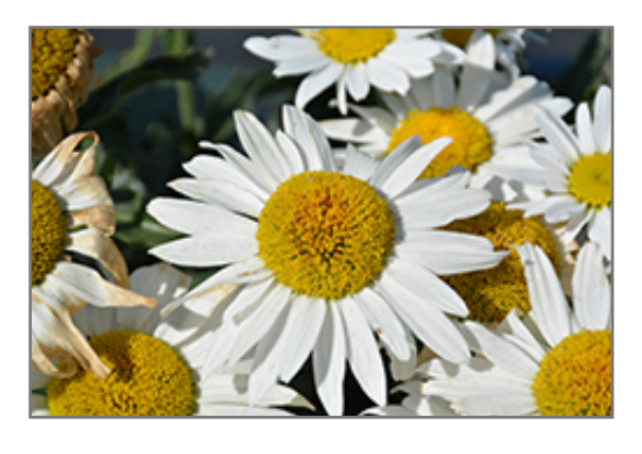
Madonna Shasta Daisy flowers

Madonna Shasta Daisy has masses of beautiful semi-double white daisy flowers with gold eyes at the ends of the stems from early summer to early fall, which are most effective when planted in groupings. The flowers are excellent for cutting. Its serrated narrow leaves remain dark green in color throughout the season.