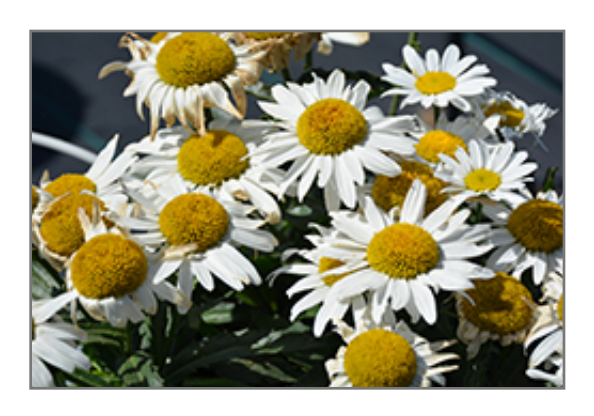
Madonna Shasta Daisy flowers