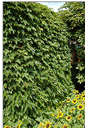
Boston Ivy