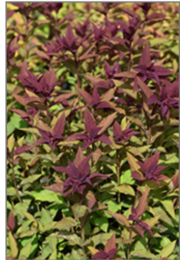
Double Play Doozie Spirea foliage

This shrub should only be grown in full sunlight. It prefers to grow in average to moist conditions, and shouldn't be allowed to dry out. It is not particular as to soil type or pH. It is highly tolerant of urban pollution and will even thrive in inner city environments. This particular variety is an interspecific hybrid.