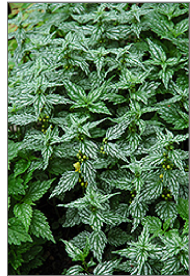
Hermann's Pride Yellow Archangel foliage