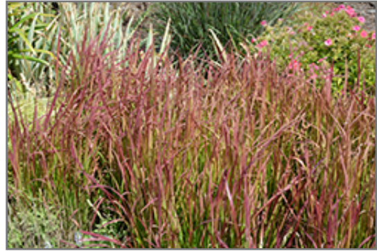
Red Baron Japanese Blood Grass

Red Baron Japanese Blood Grass will grow to be about 20 inches tall at maturity, with a spread of 18 inches. It grows at a slow rate, and under ideal conditions can be expected to live for approximately 20 years. As an herbaceous perennial, this plant will usually die back to the crown each winter, and will regrow from the base each spring. Be careful not to disturb the crown in late winter when it may not be readily seen!