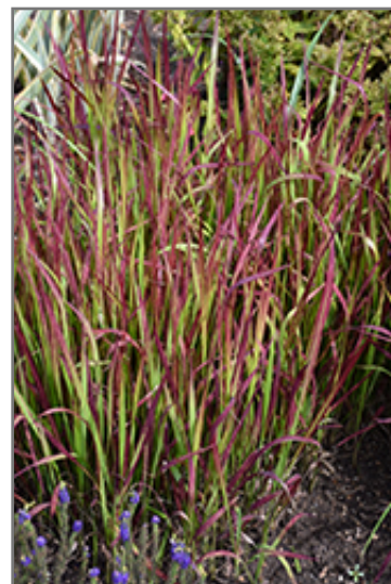
Red Baron Japanese Blood Grass foliage

Red Baron Japanese Blood Grass is recommended for the following landscape applications;