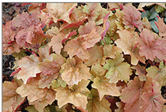
Dolce Creme Brulee Coral Bells foliage

Dolce Creme Brulee Coral Bells is recommended for the following landscape applications;