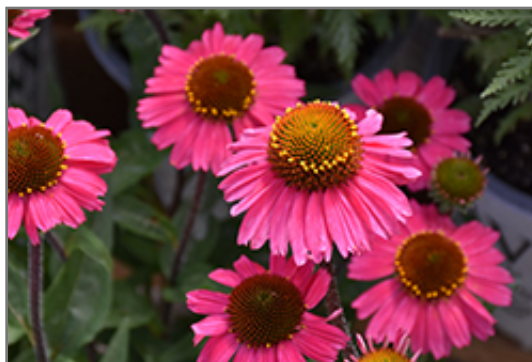
Sensation Pink Coneflower flowers

Sensation Pink Coneflower is recommended for the following landscape applications;