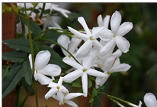
Climbing Jasmine flowers

This is a dense multi-stemmed evergreen houseplant with a spreading, ground-hugging habit of growth. This plant may benefit from an occasional pruning to look its best.