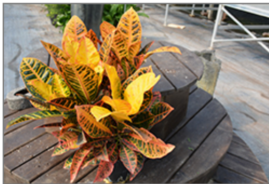
Variegated Croton