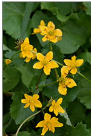
Marsh Marigold flowers