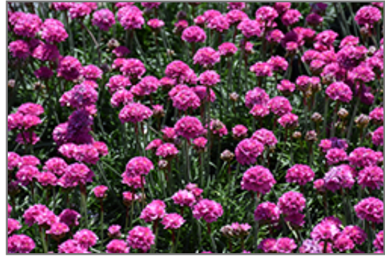
Dusseldorf Pride Sea Thrift flowers

Dusseldorf Pride Sea Thrift will grow to be only 6 inches tall at maturity extending to 8 inches tall with the flowers, with a spread of 8 inches. Its foliage tends to remain low and dense right to the ground. It grows at a slow rate, and under ideal conditions can be expected to live for approximately 10 years. As an evergreen perennial, this plant will typically keep its form and foliage year-round.