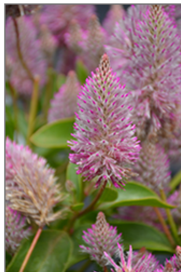
Joey Mulla Mulla flowers

Joey Mulla Mulla is recommended for the following landscape applications;