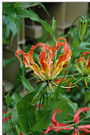
Gloriosa Lily flowers

Gloriosa Lily is recommended for the following landscape applications;