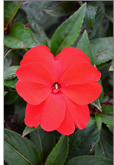
Florific Red New Guinea Impatiens flowers

Florific Red New Guinea Impatiens is recommended for the following landscape applications;