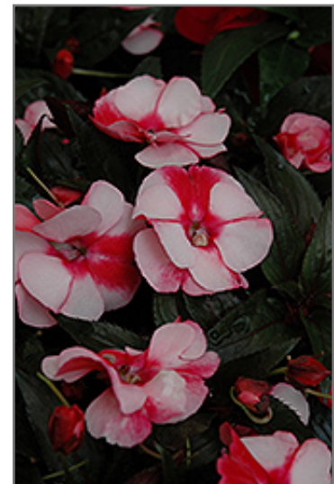
Sonic Sweet Cherry New Guinea Impatiens flowers