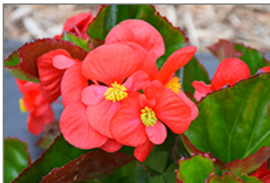
Big Red Green Leaf Begonia flowers