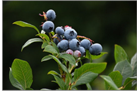
Northland Blueberry fruit