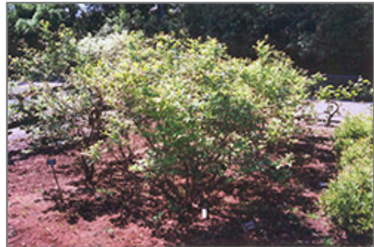
Northland Blueberry