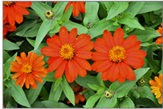
Zahara Fire Zinnia flowers

Zahara Fire Zinnia is recommended for the following landscape applications;