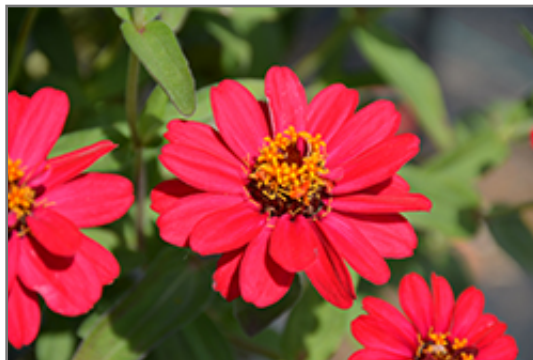
Profusion Double Hot Cherry Zinnia flowers