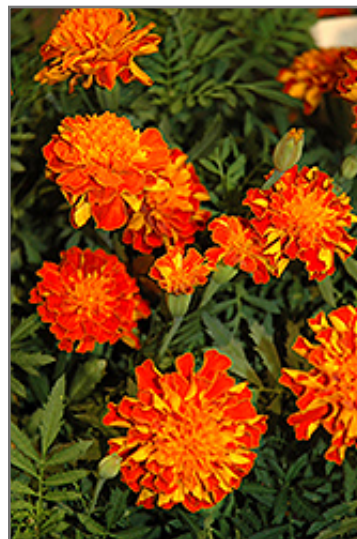
Cresta Flame Marigold flowers