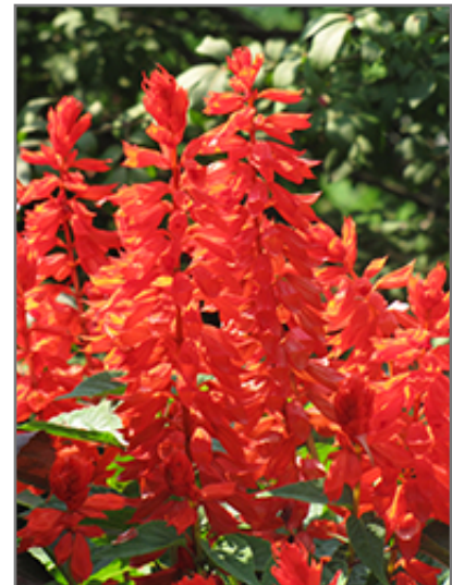
Lighthouse Red Sage flowers