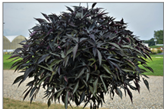
Illusion Midnight Lace Sweet Potato Vine