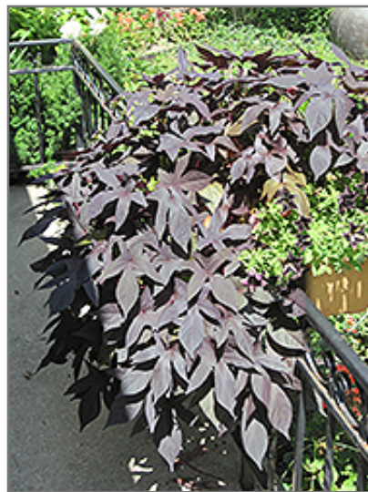
Proven Accents Blackie Sweet Potato Vine