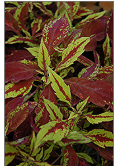
Pineapple Coleus foliage