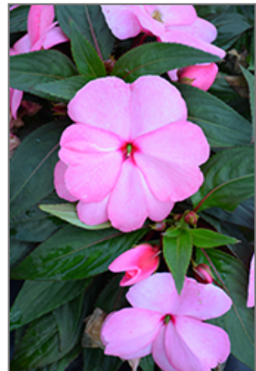
Sonic Light Pink New Guinea Impatiens flowers