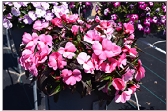
Sonic Light Pink New Guinea Impatiens in bloom

Sonic Light Pink New Guinea Impatiens will grow to be about 12 inches tall at maturity, with a spread of 12 inches. When grown in masses or used as a bedding plant, individual plants should be spaced approximately 10 inches apart. Its foliage tends to remain dense right to the ground, not requiring facer plants in front. This fast-growing annual will normally live for one full growing season, needing replacement the following year.