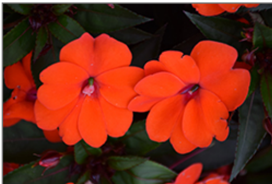
SunPatiens Compact Orange New Guinea Impatiens flowers

This plant will require occasional maintenance and upkeep, and should not require much pruning, except when necessary, such as to remove dieback. It is a good choice for attracting bees and butterflies to your yard. It has no significant negative characteristics.