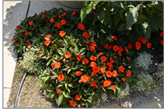
SunPatiens Compact Orange New Guinea Impatiens in bloom

SunPatiens Compact Orange New Guinea Impatiens is a fine choice for the garden, but it is also a good selection for planting in outdoor containers and hanging baskets. It can be used either as 'filler' or as a 'thriller' in the 'spiller-thriller-filler' container combination, depending on the height and form of the other plants used in the container planting. It is even sizeable enough that it can be grown alone in a suitable container. Note that when growing plants in outdoor containers and baskets, they may require more frequent waterings than they would in the yard or garden.