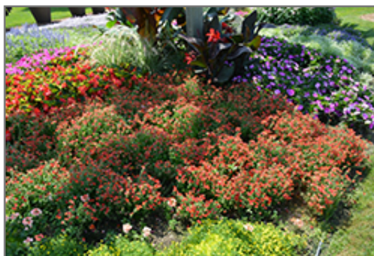
Sunsatia Cranberry Nemesis in bloom