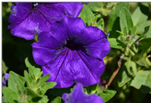
Easy Wave Blue Petunia flowers