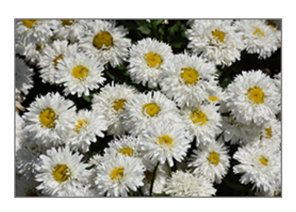
Laspider Shasta Daisy flowers

An outstanding shasta daisy producing stunning, frilly white double blooms with golden centers; a beautiful addition to the garden when massed; hardy and blooms througout the summer