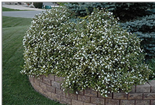
Abbotswood Potentilla in bloom