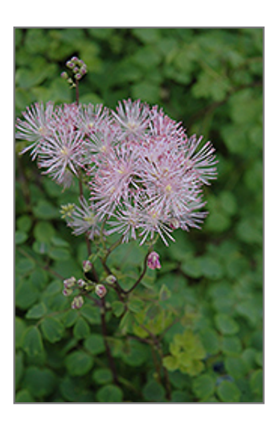
Meadow Rue flowers

A beautiful plant from our native meadows with columns of steely blue foliage arising in spring, turning to a glaucous green; stately stems topped with bright white and violet flowers; lovely massed along borders; will readily naturalize