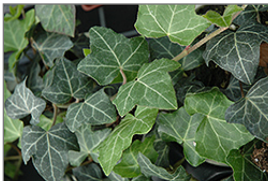
Baltic Ivy foliage