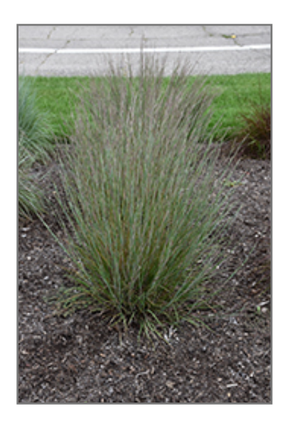
Carousel Bluestem in bloom