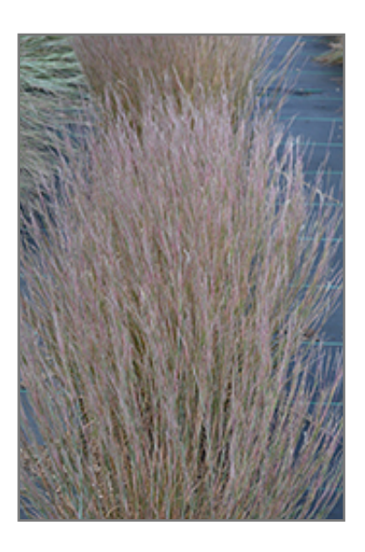
Carousel Bluestem in fall