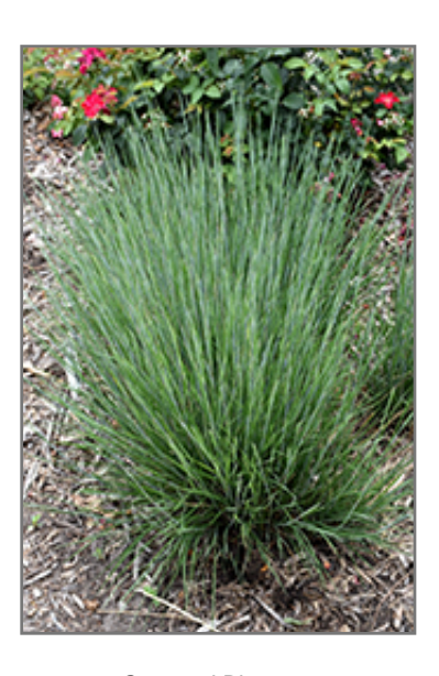
Carousel Bluestem