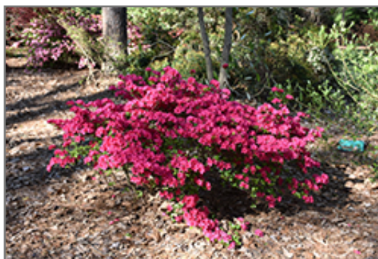
Girard's Fuchsia Evergreen Azalea in bloom