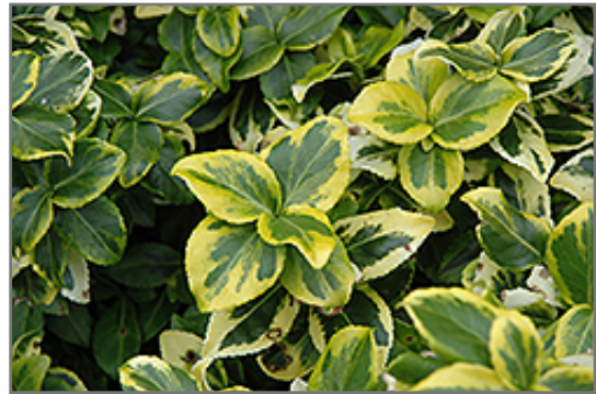
Gold Prince Wintercreeper foliage