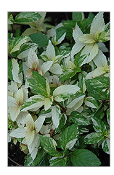
Variegated Peppermint foliage