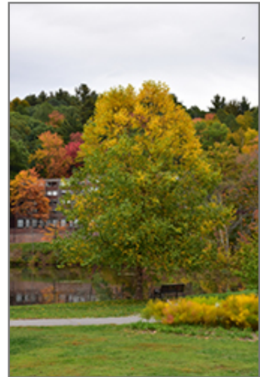
Heritage River Birch in fall

This tree does best in full sun to partial shade. It is quite adaptable, preferring to grow in average to wet conditions, and will even tolerate some standing water. It is not particular as to soil type, but has a definite preference for acidic soils, and is subject to chlorosis (yellowing) of the foliage in alkaline soils. It is highly tolerant of urban pollution and will even thrive in inner city environments. Consider applying a thick mulch around the root zone in winter to protect it in exposed locations or colder microclimates. This is a selection of a native North American species.