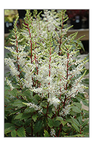
Rock And Roll Astilbe flowers

Striking white colored plumes rising above glossy leaves; perfect in a shady spot with dappled light; prefers moisture so water regularly for abundant flowers and nice foliage