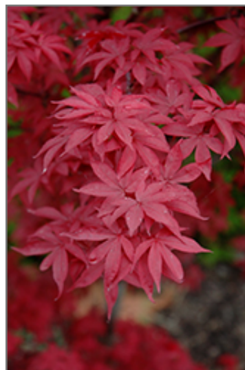
Twombly's Red Sentinel Japanese Maple foliage

Twombly's Red Sentinel Japanese Maple is ideal for use as a garden accent or patio feature, and is recommended for the following landscape applications;